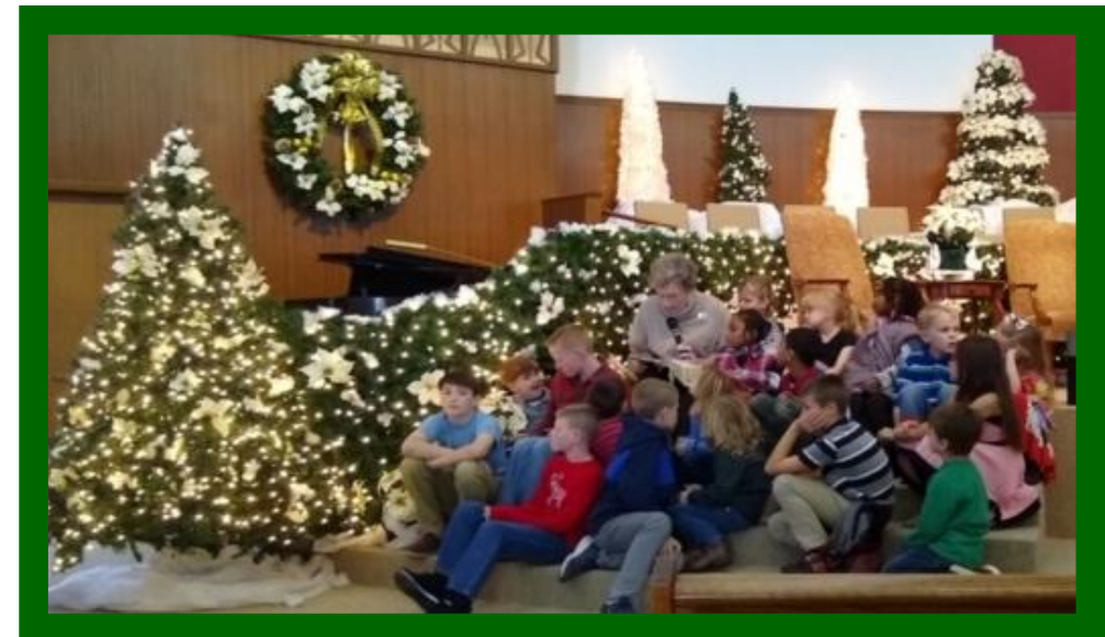
FBC Kids listening to the Christmas Story!!!