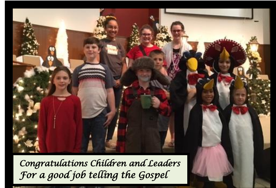
Congratulations Children and Leaders For a good job telling the Gospel