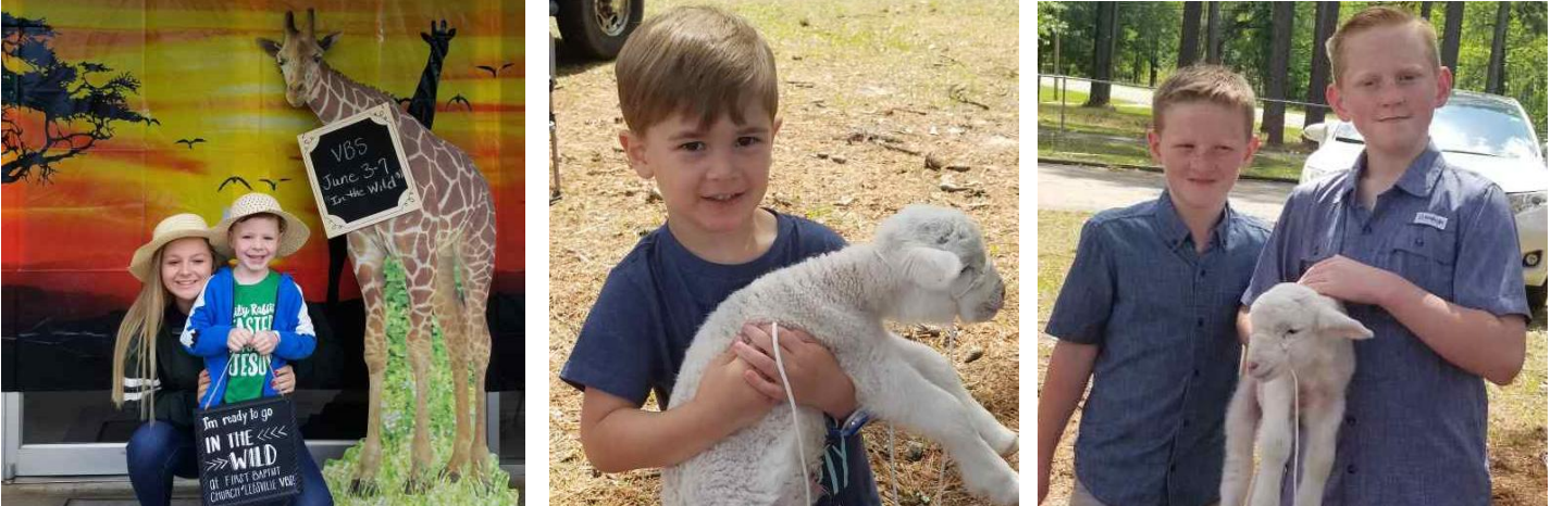
Thanks to all who worked to make 2019 "Easter in the Wild" a huge success!!!