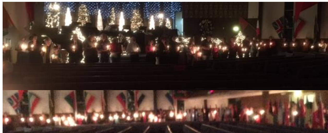
December 24 th , Christmas Eve Candle Light Service

Tapestry January 10 th Please bring finger foods! If you have never been a part of Tapestry, now would be an excellent time to begin! Everyone welcome!! Meets the 2 nd Tuesday of each month in the CLC. Devotionals, good fellowship & delicious food!!!!