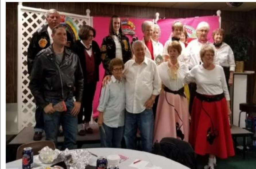
Choir Party-in case you are too young to remember -it was a 50's theme