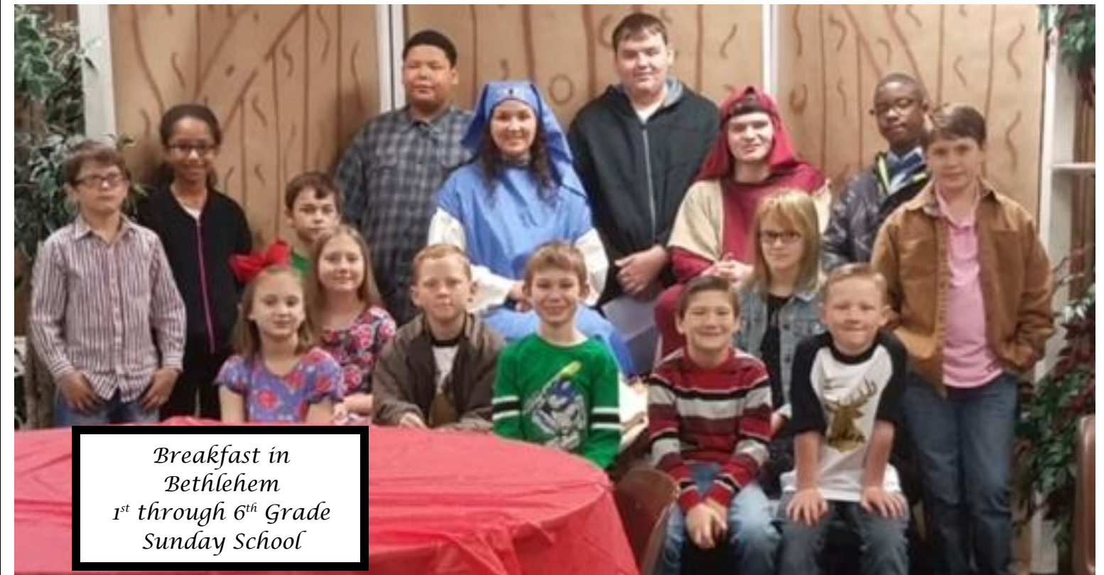
Breakfast in Bethlehem 1 st through 6 th Grade Sunday School

May God bless you all more abundantly than you could ever hope or expect.