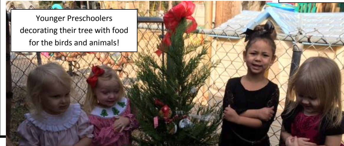
Younger Preschoolers decorating their tree with food for the birds and animals!

If you missed Christmas at First Baptist this year, you should make plans now to attend the celebration of the birth of Jesus next year here at FBC!!