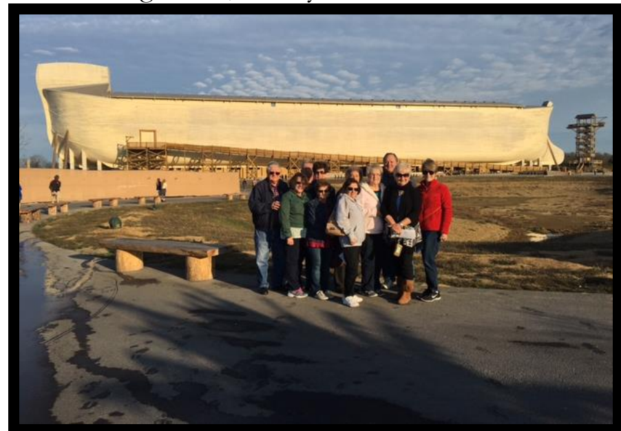
It appears that our DMA group located the Ark. In Kentucky, no less!