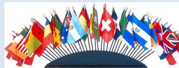
Children's Parade of Flags December 18, 2022

Tapestry meets every second Tuesday of the month. Come and join them for fun, food, fellowship & Bible study. All ladies are welcome!